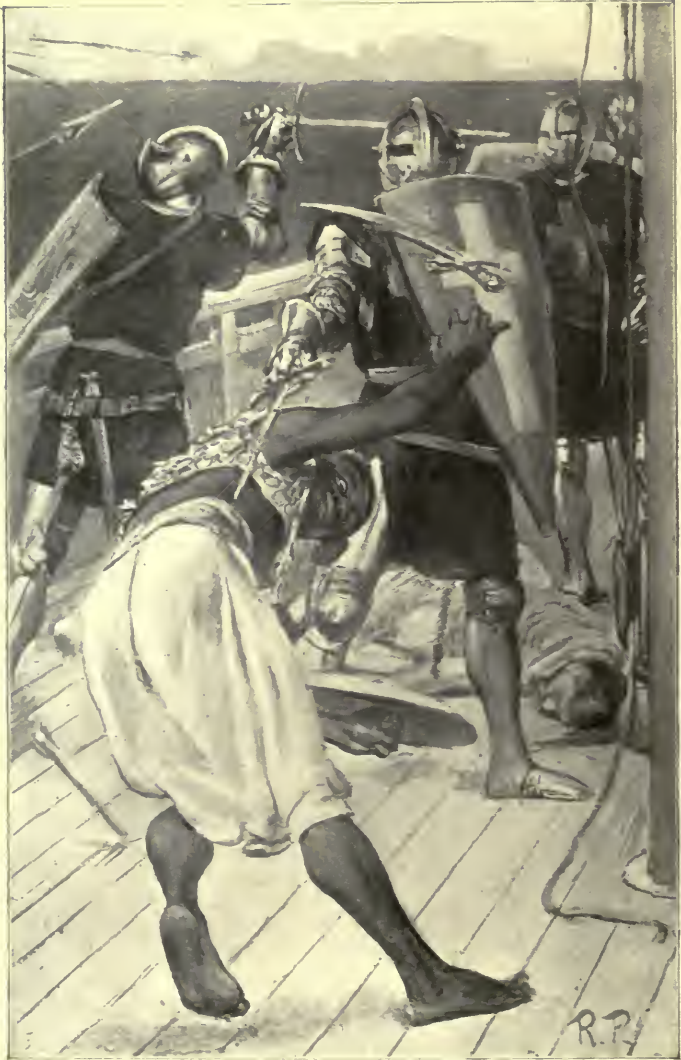
THEN THE KNIGHTS LEAPT ON TO THE DECK OF THE PIRATE.